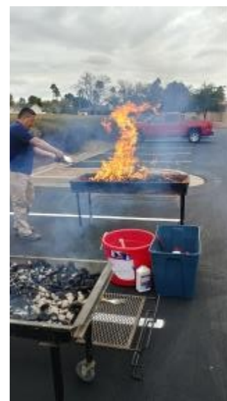
Luis says to start small to achieve bigger successes!