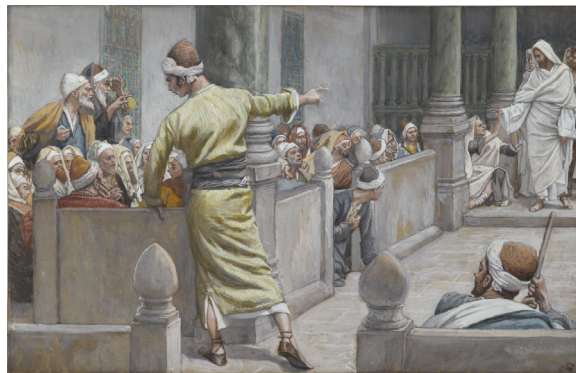
The Healed Blind Man Tells His Story to the Jews, James Tissot

we should always come to Jesus for a divine touch, and frequently go for a wash through (sacraments) the water of baptism, confessional, and the eucharist. Our approach may not be perfect, however, out of the magnanimity of Jesus, He supplies for the faith that we may lack, to possibly