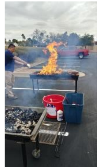
Luis says to start small to achieve bigger successes!